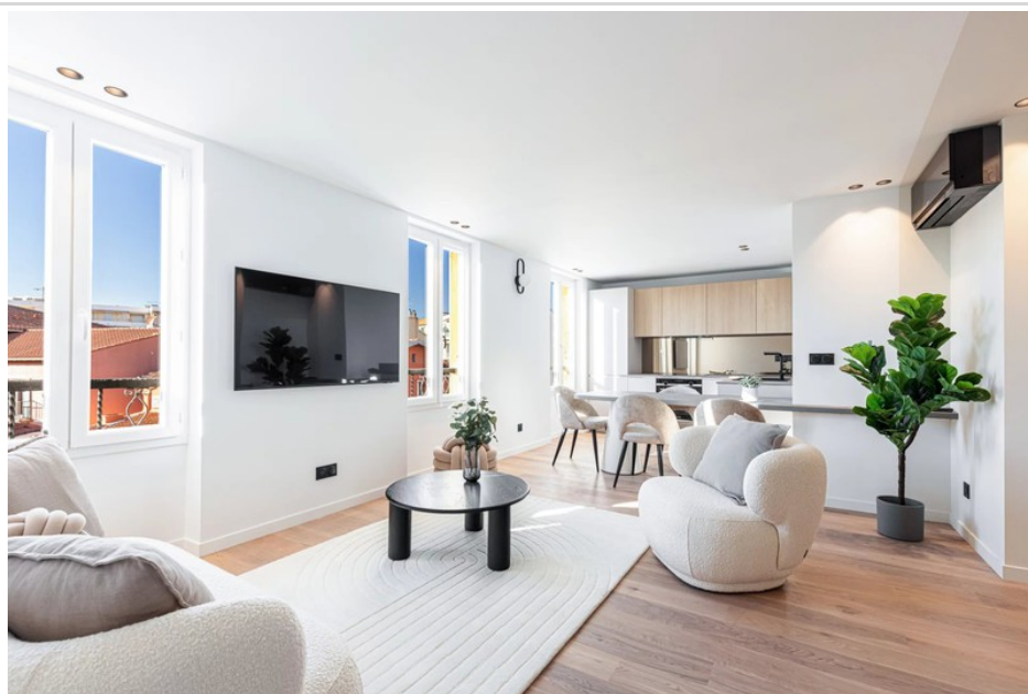
Apartment 44 Nice